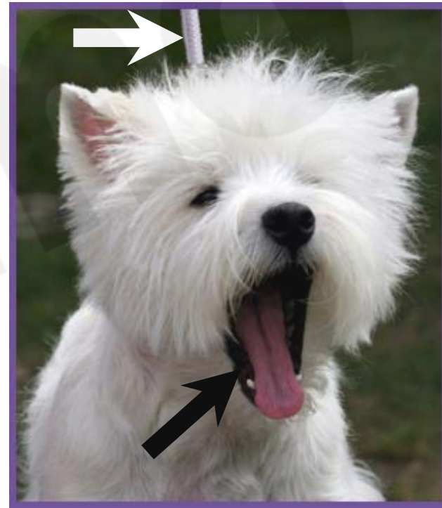
Please stop that